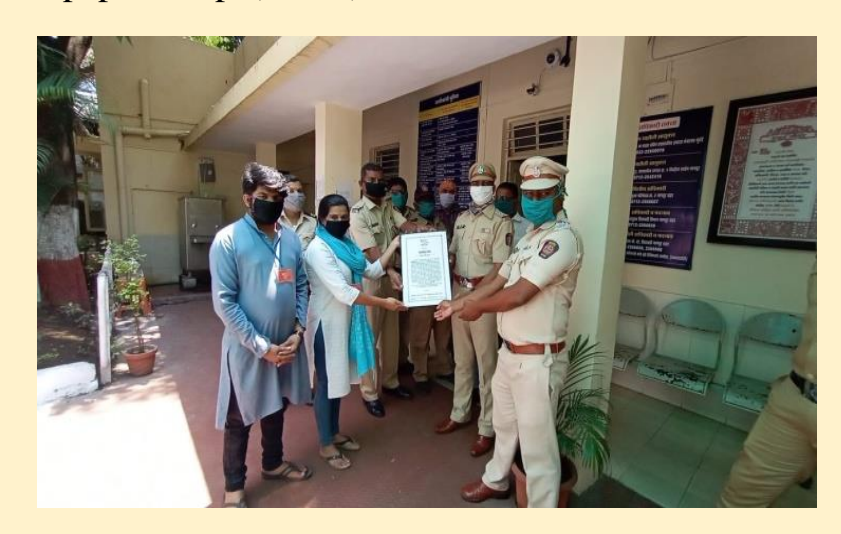
Alumni being recognized for their contribution in social welfare