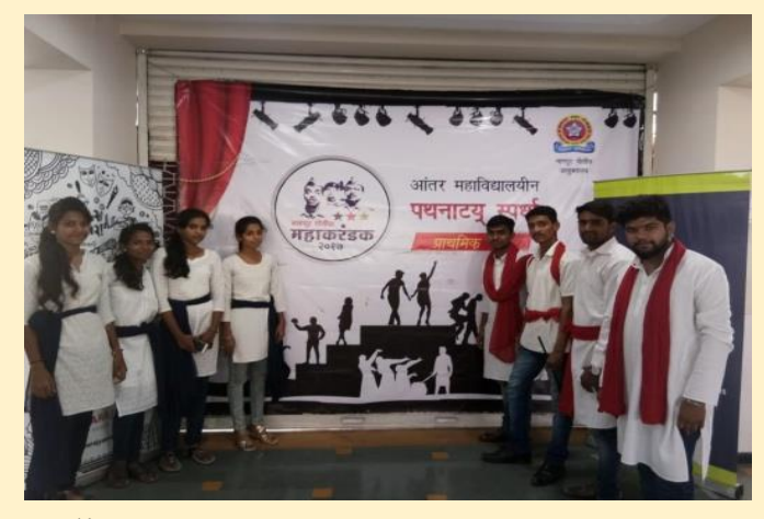
'MAHA KARANDAK' Nagpur Police HQ. Inter Collegiate Street Play Participated and Directed by students who work in NGO MALHAR (2017)