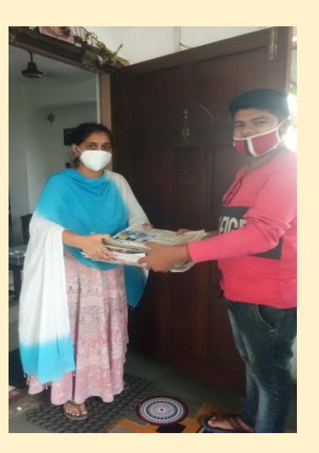
Alumni Collecting newspaper scraps(Raddi)