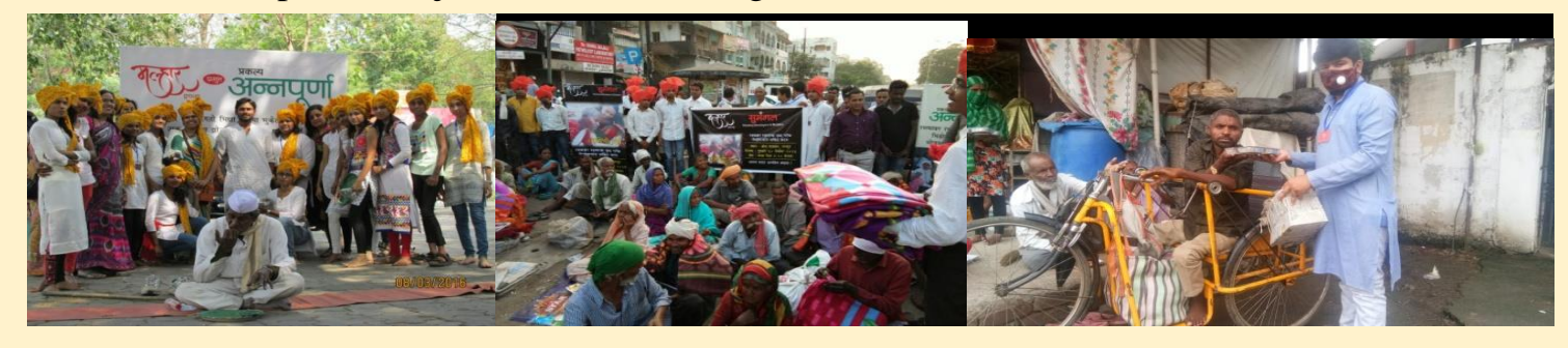
Our Students who work with NGO MALHAR distributing food and Blanket to beggars & needy